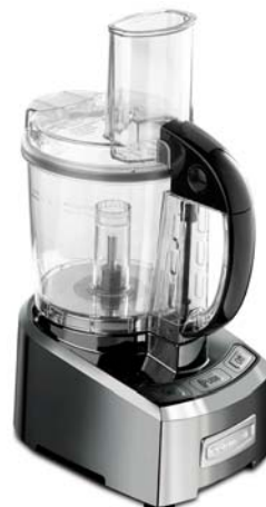
MFP-107BCHC, Color: Black Chrome UPC: 068459093462