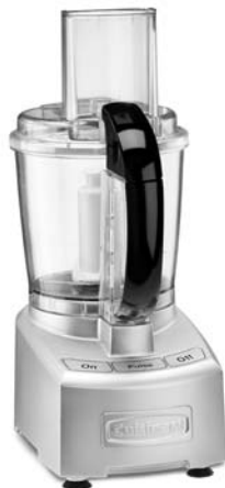
MFP-107BCC, Color: Silver UPC: 068459080301